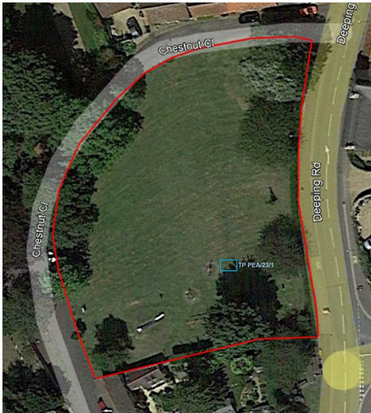
Attachment 4 - drawing showing locations of relevant previous archaeology.