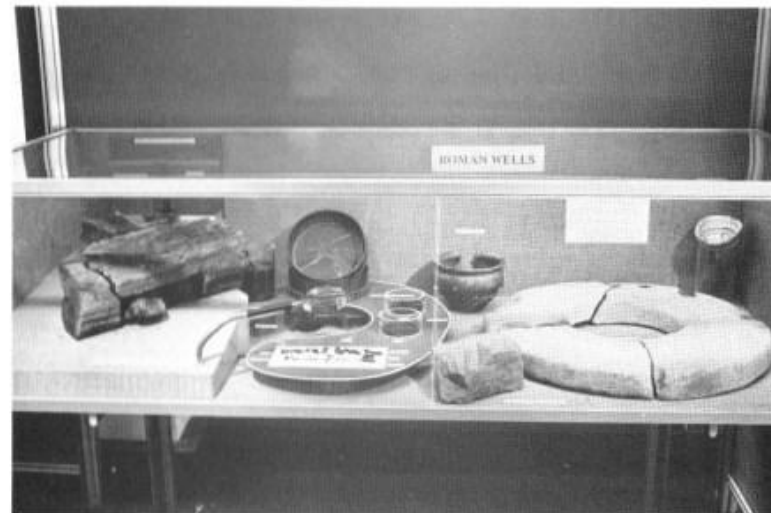
Figs 22, 23 Above Exhibition 6000, bottom a display case showing Roman Well finds