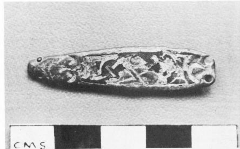
Fig 14 The Anglo-Saxon strap end from Bulwick